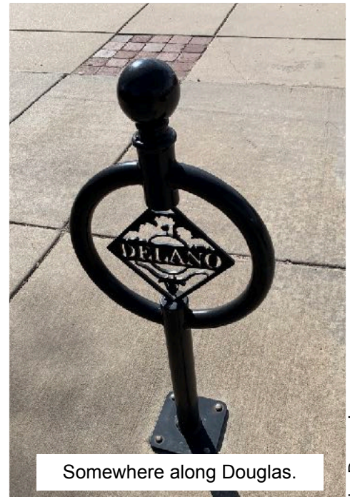
Somewhere along Douglas.