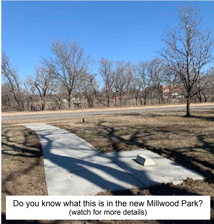
Do you know what this is in the new Millwood Park? (watch for more details)