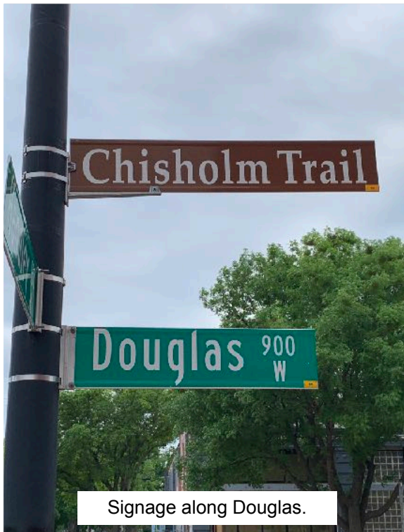
Signage along Douglas.