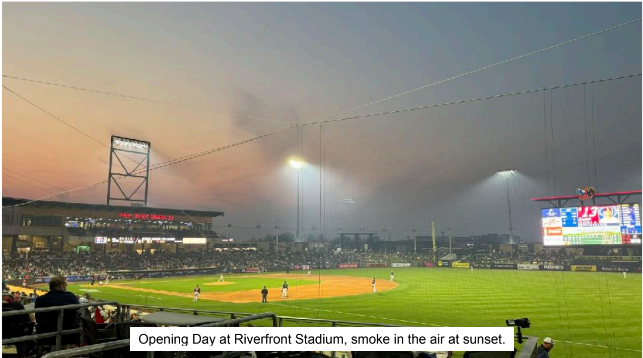
Opening Day at Riverfront Stadium, smoke in the air at sunset.