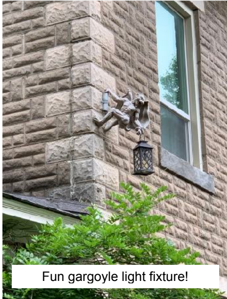
Fun gargoyle light fixture!