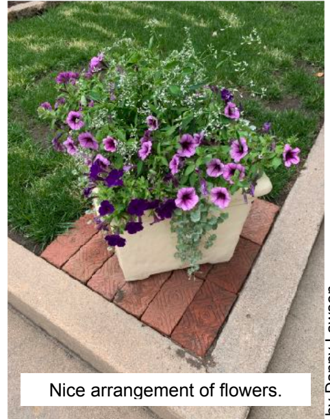
Nice arrangement of flowers.