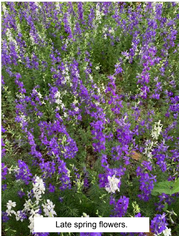
Late spring flowers.